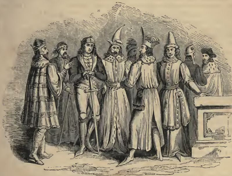
ENGLISH AND GASCON LORDS AT BORDEAUX. From an old Black Letter History of Bertrand du Guesclin.

money at command, as well as my people, when I made war for the king of England, than I have now; for, whenever we took any excursions in search of adventures, we never failed meeting some rich merchants from Toulouse, Condom, la Réole, or Bergerac, whom we squeezed, which made us gay and debonair, but now all that is at an end." The knight, on hearing this, burst into laughter and replied, "In truth, that is the life Gascons love: they willingly hurt their neighbour." On hearing this, I concluded that the lord d'Albreth heartily repented his having turned to the French, in the same manner as the lord de Mucident, who, when made prisoner at Yurac, swore to the duke of Anjou, he would set out for Paris and become ever after a good Frenchman. He did go to Paris, where the king handsomely received him; but he was not treated to his satisfaction, so that he slunk away from the king, and left Paris without taking leave, to return to his own country, where he again became an Englishman, and broke all his engagements with the duke of Anjou. The lords de Rosem, de Duras, de Langurant, did the same.